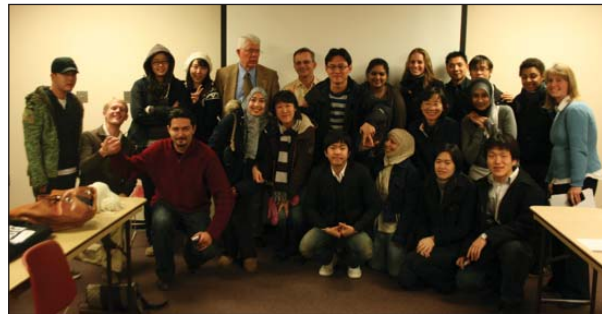
Dialogue course participants.

The course began with a dialogue workshop designed to build trust and develop individual communication skills such as listening, identifying assumptions, and asking questions. The class then moved to a series of eight dialogues on topics relevant to the election, including immigration, the role of religion in government, the relationship of the West and Muslim world, and race, ethnicity, and nationalism. Student groups designed and led each dialogue, giving them the opportunity to experiment with different formats and techniques. Although designed to maximize the time the students spent learning together, the course also allowed opportunities for the two groups of students to reflect on their experiences separately.