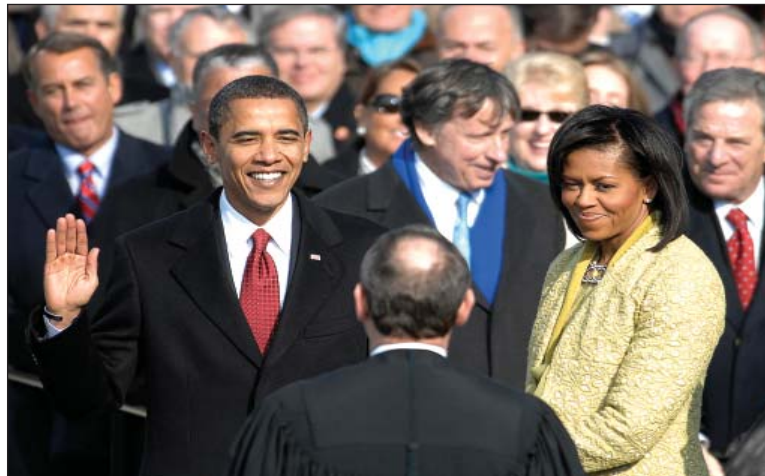
Barack Obama taking the Oath of Office.

Since his election and inauguration, it has been clear that Barack Obama, represents many things to many people, not only in the U.S., but worldwide as well. I experienced his global appeal when I was in Kuala Lumpur, Malaysia, and a Muslim Tamil Indian, who considers himself a member of Malaysia's minority population, confided that he was exhilarated by Obama's empowering maxim: "Yes, we can!"